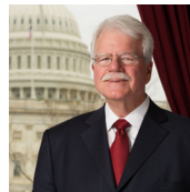
REP. GEORGE MILLER Congressman of California