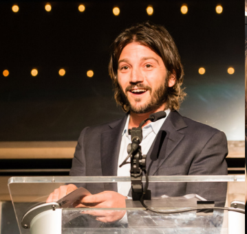
Diego Luna, Actor/Director and WOLA Board Member